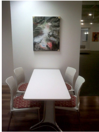
Bullfrog, 2009 oil on canvas $5,000