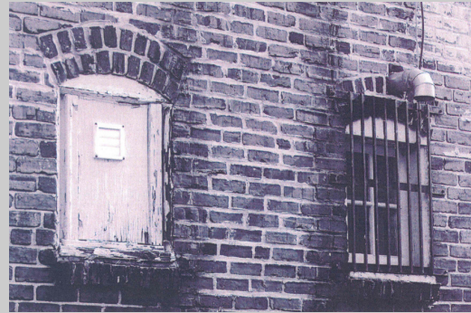
Doug Oswald, Untitled , 2006

These are, by their very nature, idiosyncratic and secret images pulling us into personal visions of particular situations.