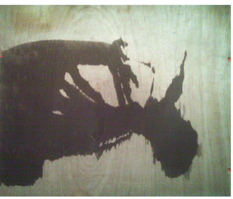
Stefan Eins, Monkey Rides a Donkey, 1995, poured acrylics, gesso on wood, 28 x 34"