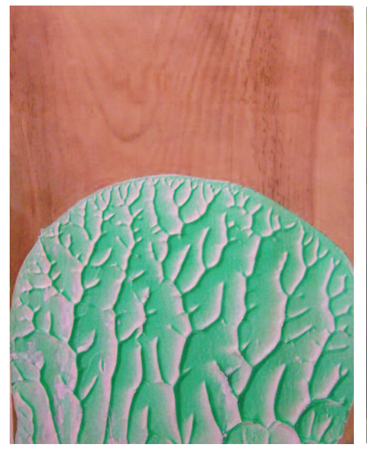
Stefan Eins, Growth, 2002, gesso, lacquer paint on wood, 11 x 8.5"