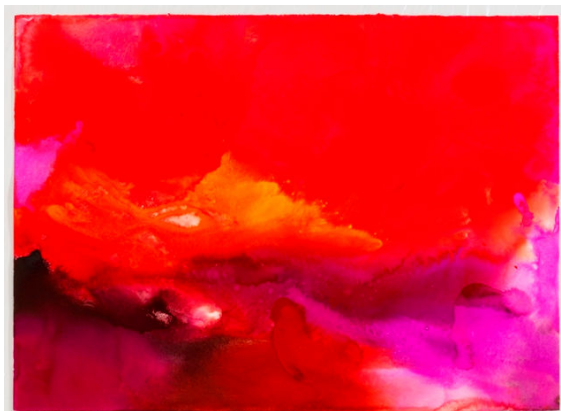
Land of the Gandharvas, 2011 35 x 45 in, gouache on paper $4,000.