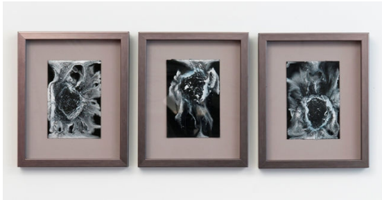
Triptych, 2011 12 x 10 in each, gouache on paper $1,000.